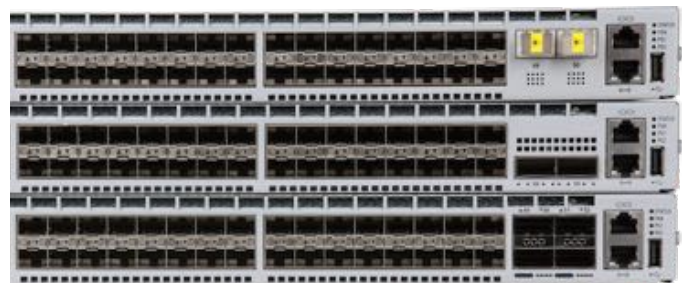
Arista 7280E Flexible Port Combinations

7280SE-64: 4 QSFP+ ports for 4x 40G or 16x10G