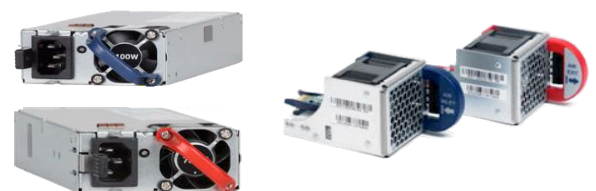
Hot swap and reversible power supply and fan modules