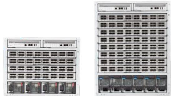
Arista 7300X Series Chassis

The midplane is completely passive and provides control plane connectivity to each of the fabric and line card modules. The system is optimized for data center deployments with front-to-rear and rear to front airflow options.